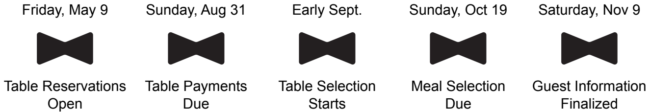
TABLE HOST RESPONSIBILITIES

Our Table Host program is an important fundraising tool for Black Tie Dinner, directly impacting the funding we distribute to our beneficiaries. As a Table Host, you can host an entire table with ten (10) seats for your friends and colleagues. A table costs $5,000 and can be paid entirely by the Table Host or by individual guests at $500 a seat.